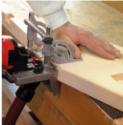
For use in staircase construction, in the workshop and on site.