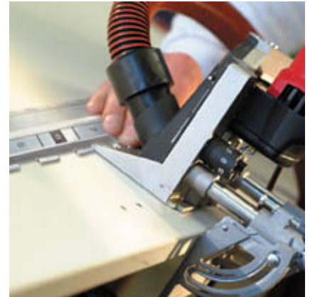
Quick and economical: Making carcasses with the DD40 and dowel template.