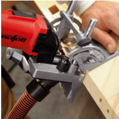
Fast and accurate: Edge-to-edge and mitre corner joints.