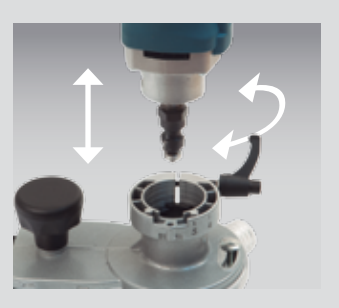
The new micrometric adjustment system makes it very easy to regulate trimming head height.