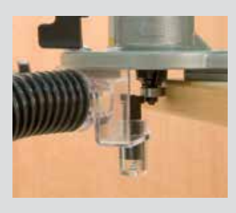
Adjustable vacuum connection equipped with a bearing brake to prevent leaving marks on the edge.