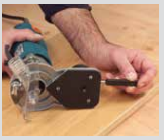
Corner trimming device easy to prepare and to use. When not in use it can be hidden into the base.