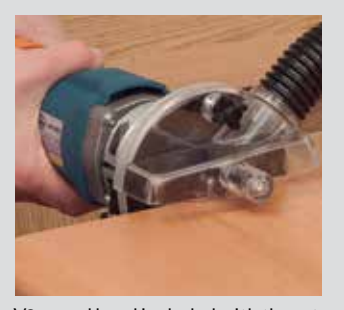
V3 round head included with the set.

V3 round head included with the set. Very practical for trimming with support on edges and essential for jobs that require this type of work.